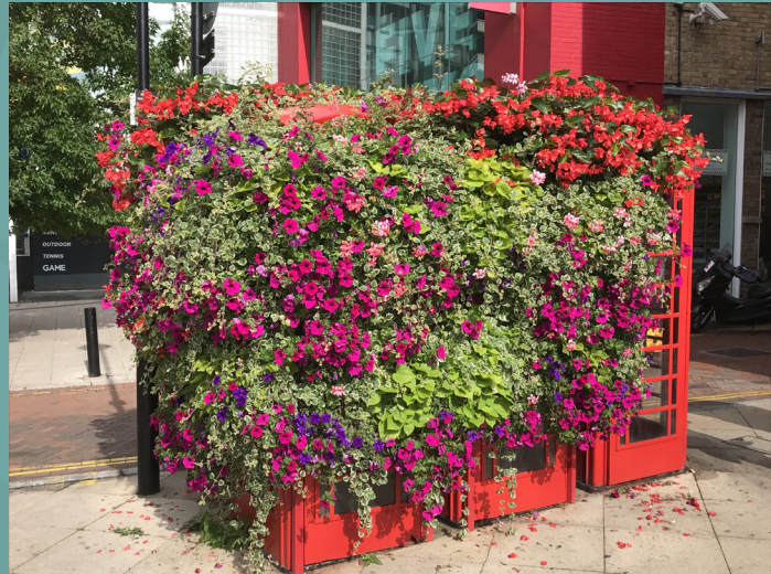
Flowery Telephone Boxes in Uxbridge

Like many organisations, we have used Zoom as the means of transacting our business during Lockdown and other restrictions. The NURA business group, which has oversight of our activities, meets by Zoom. We will continue to update residents of any significant developments, either by Flyer, Newsletter or social media. We keep our Website up to date. We also respond to residents' requests for assistance, e.g. in the preparation of Planning e-Petitions.